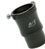
■ W.O. 2" extender / adapter.