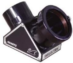
2" SCT Quartz Dielectric Diagonal