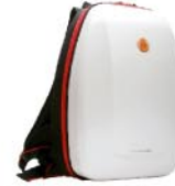
■ Stylish pearl white backpack, with custom-fitted foam, water resistant, carry-on size.