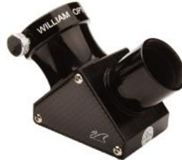
1.25" Dielectric Carbon Diagonal