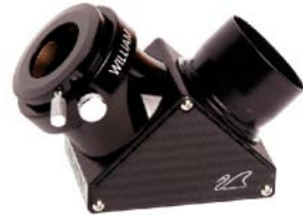
2" Dielectric Carbon Fiber Diagonal