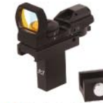
■ Red dot finder.