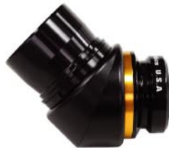
1.25" 45° with 2" Barrel